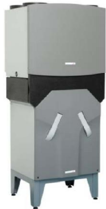
ComfoAir 350 + Artic 350